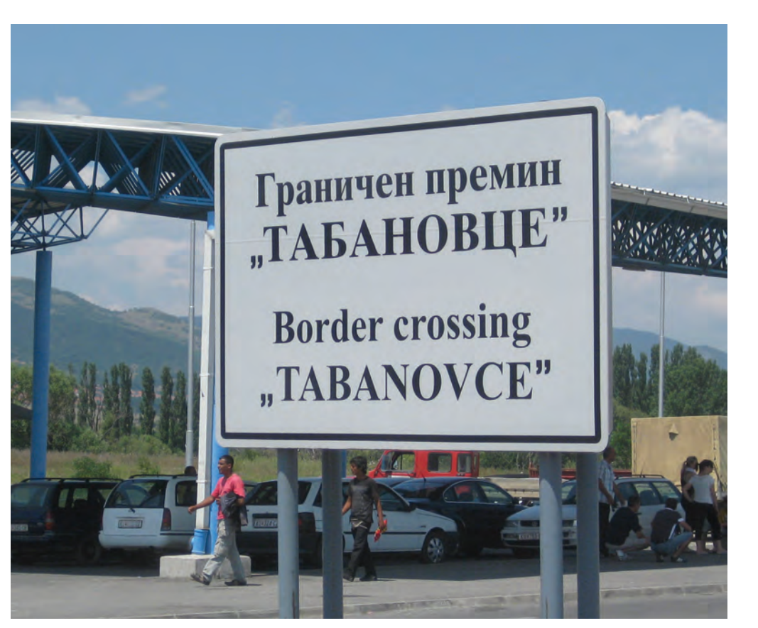
Bottleneck: border crossing between Macedonia and Serbia, July 2011.