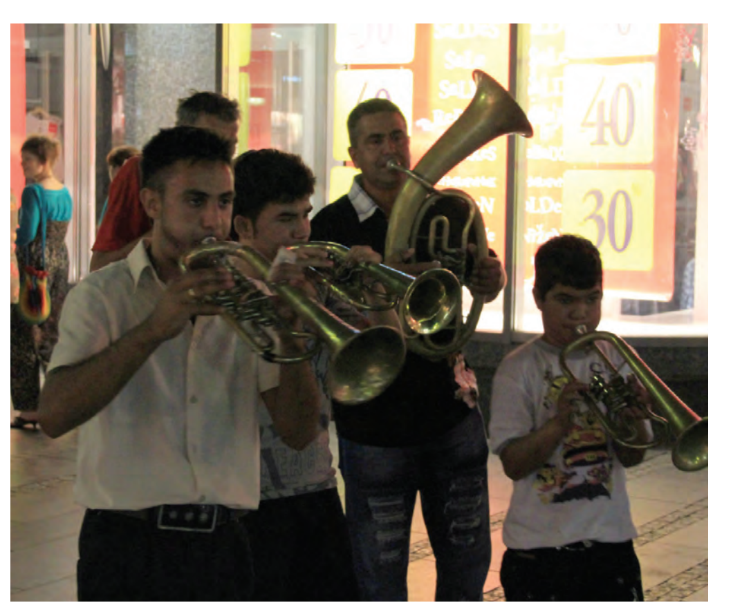
Musicians in Belgrade, July 2011.