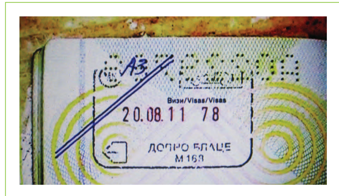
Not allowed to leave

Reports provide an indication of the highly arbitrary character of these controls and the exit bans they entail.